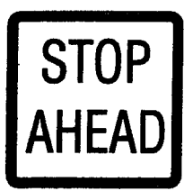
STOP AHEAD SIGN