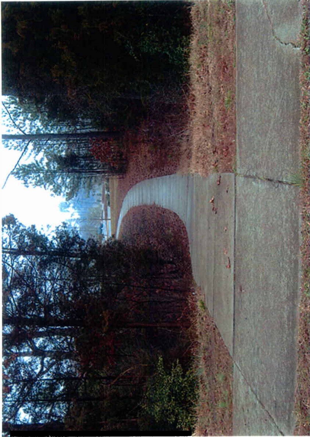
Site Photo 11 View NNW into site showing walkway from Sage Road end.