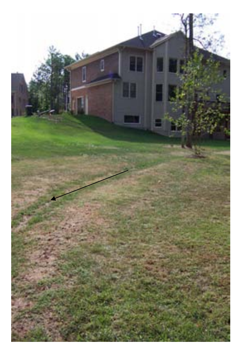
Photo 2 – Arrow indicates location of roof drain lines from 412 and 410 Simerville Rd, across Ms. Brown's property.