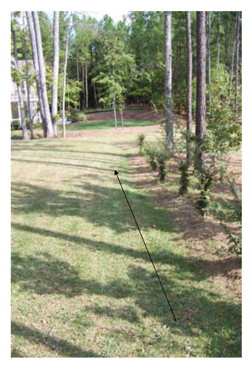
Photo 1 – Looking toward side drainage ditch along a drainage swale in Ms. Brown's yard. Arrow indicates direction of drainage. Roof drain lines from homes at 412 and 410 Simerville Rd come in from right, just past the natural area.