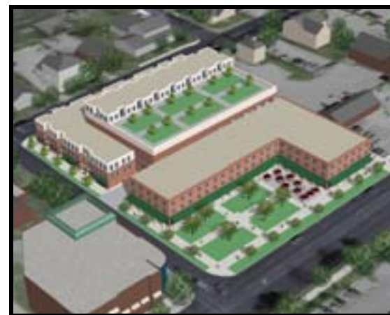
Computer illustration of concept

Pedestrian Access: North-south pedestrian connection between buildings and eastern property line