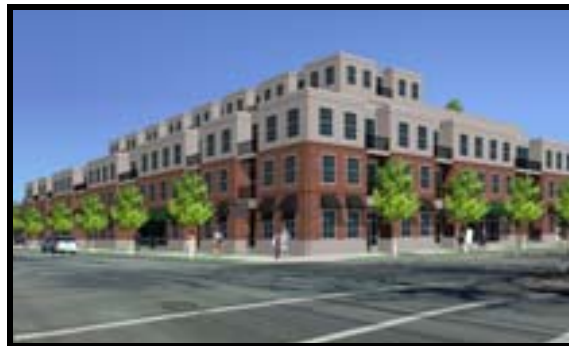
Illustration depicting three-story building on Rosemary Street (fourth story is residential space on top of the garage) (See "E" above)

Parking spaces: 100 per level (300 total)