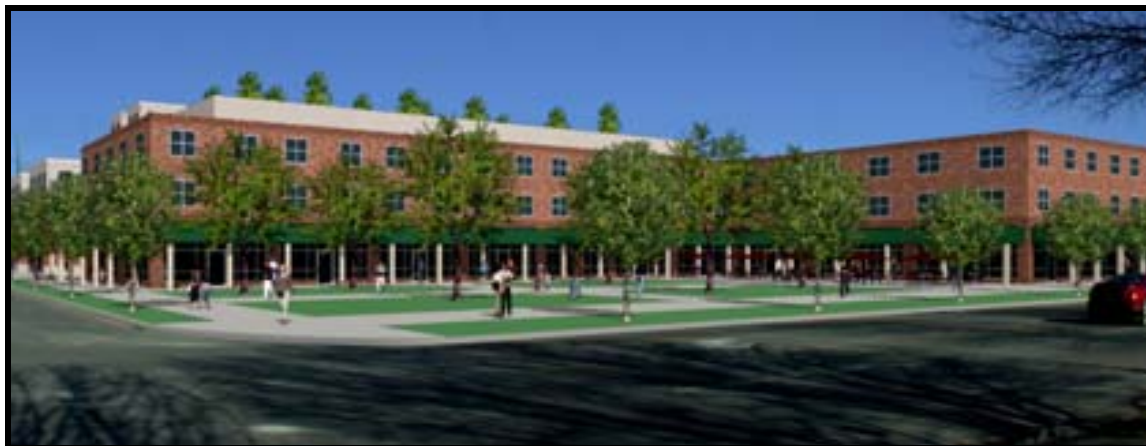
Computer illustration showing street-level view of public space and building, seen from Franklin Street at Church Street looking north.