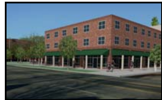
Illustration depicting three-story building on Franklin Street on eastern edge of site