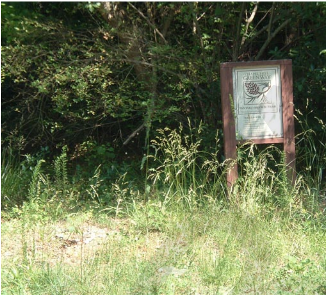
Figure 4.1: Existing signage at the entrance of the Tanyard Branch Trail from Northside. Entrance is poorly defined.

Future plans for the Greenway incorporate a paved Greenway Trail between Umstead Park and the western end of McMasters Street as well as connecting Umstead Park to Bynum Street. According to this plan, the existing Tanyard Branch Trail will remain unpaved from the western end of McMasters Street to Caldwell Street. It is recommended that the proposed improvements are carried out to increase mobility in the Northside neighborhood.