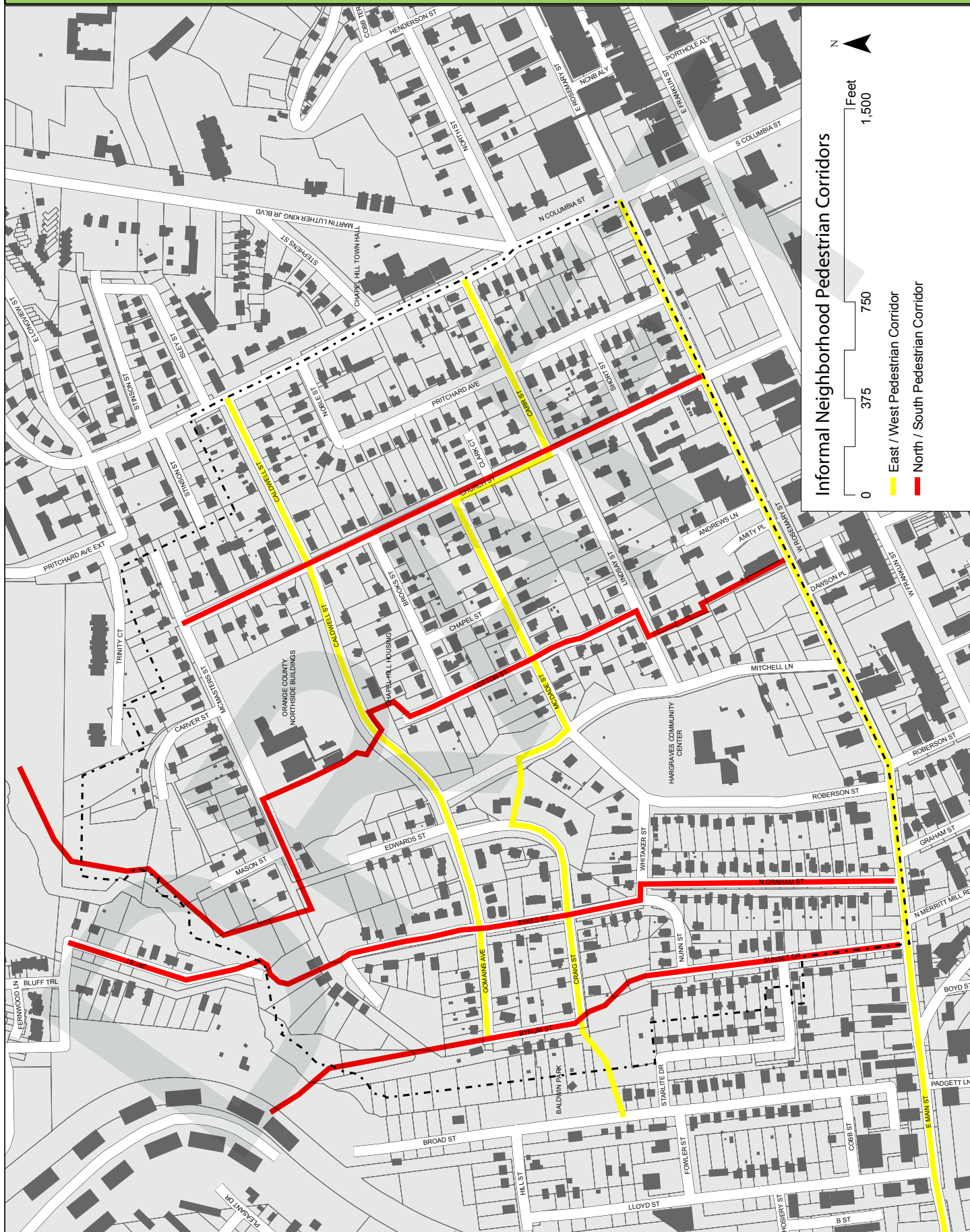
Figure B: Informal Neighborhood Pedestrian Corridors