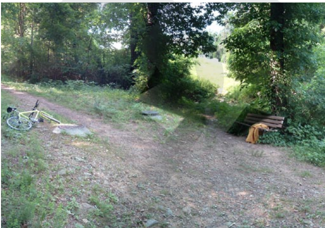
Figure 4.3: Greenway Trail as it enters Northside from the north.