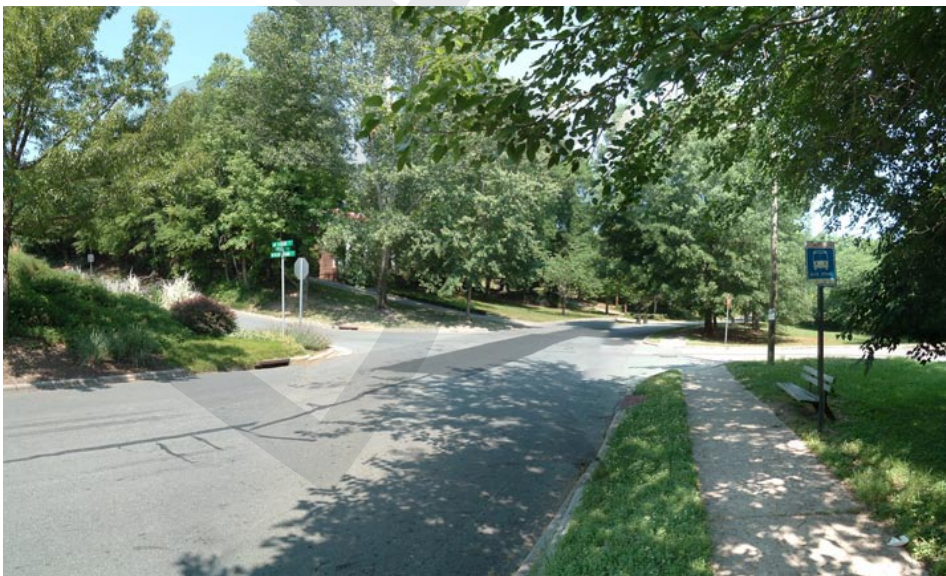
Figure 3.1: Existing Conditions at the intersection of Mitchell Lane and Roberson Street. Proposed improvements will add stop signs and crosswalks at this intersection.

The existing stop signs, crosswalks, and school bus stops can be seen in figure E. See the Mobility Improvement Plan (Figure A) for the location of the proposed crosswalk, stop sign, and traffic calming improvements.