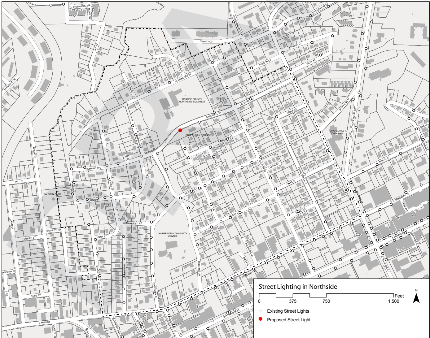
Figure G: Streetlight Location in Northside