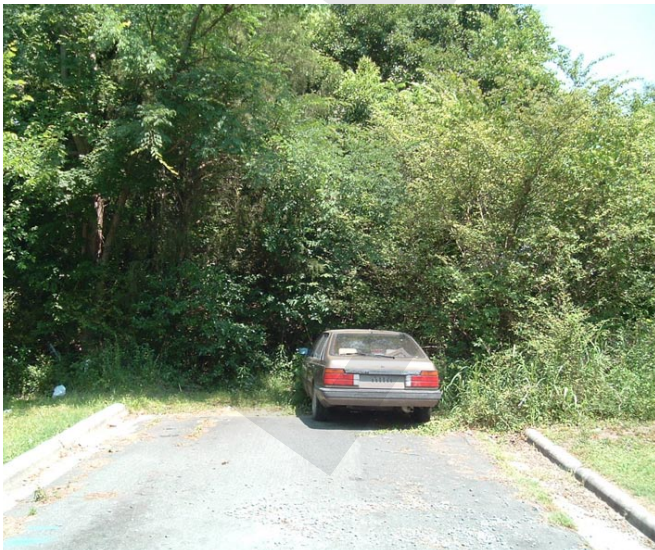
Figure 1.3.2: The end of Cotton Street looking north. Location of the proposed pedestrian path.