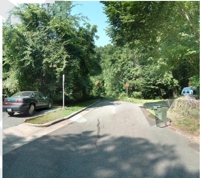
Figure 4.2: Entrance to Tanyard Branch Greenway Trail from McMasters Street. Entrance is poorly defined.