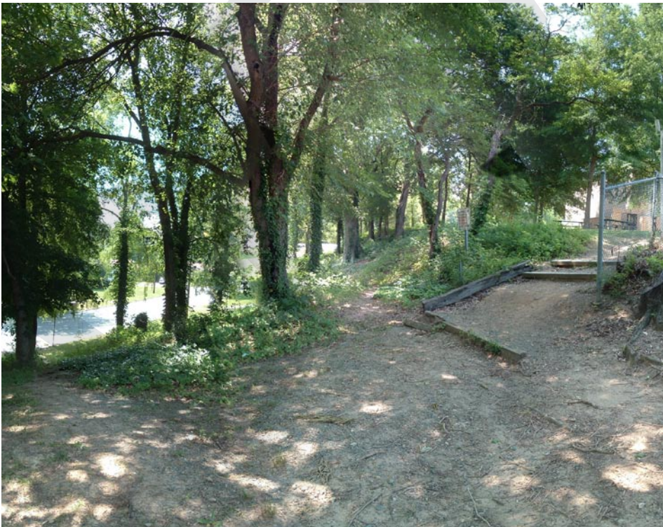
Figure 5.1: Existing pedestrian trails through the Hargrave site. Formalizing these paths would recognize the preferred routes that pedestrians choose when accessing the facilities on the site or crossing the site.