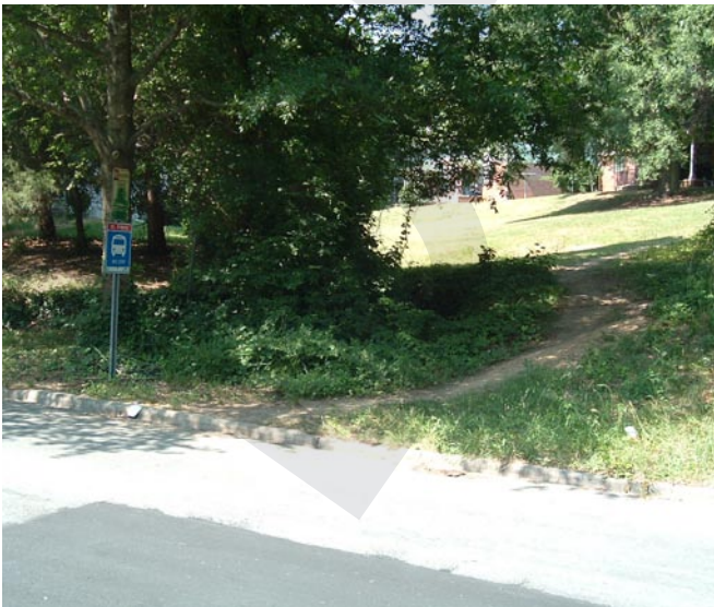
Figure 1.6: Informal Pedestrian Path from Mitchell Street to Craig Street.