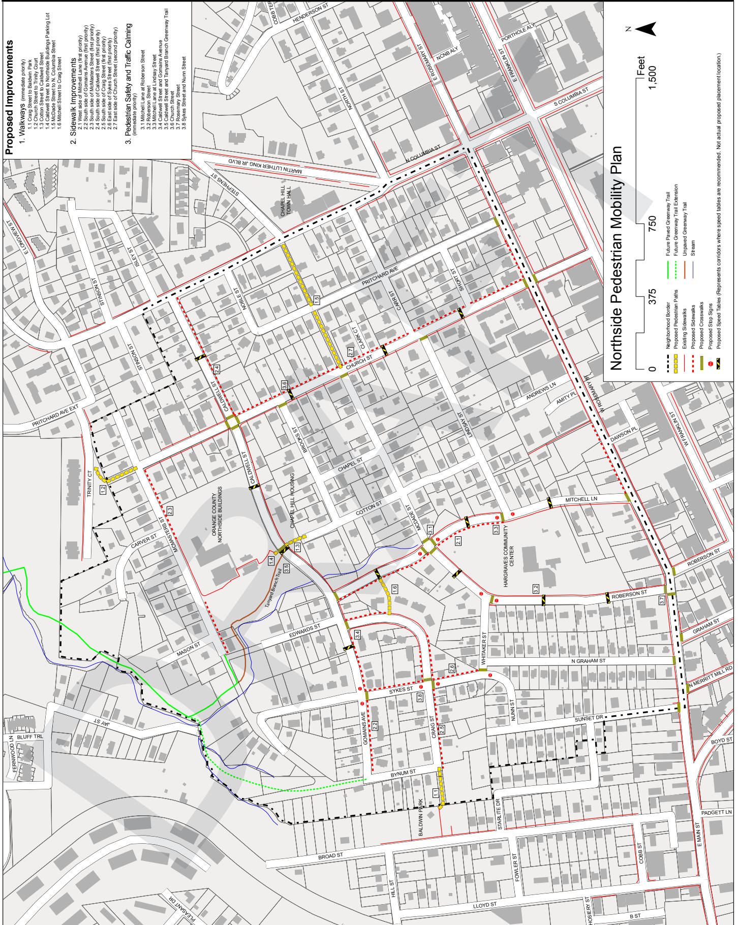
Figure A: Northside Pedestrian Mobility Plan