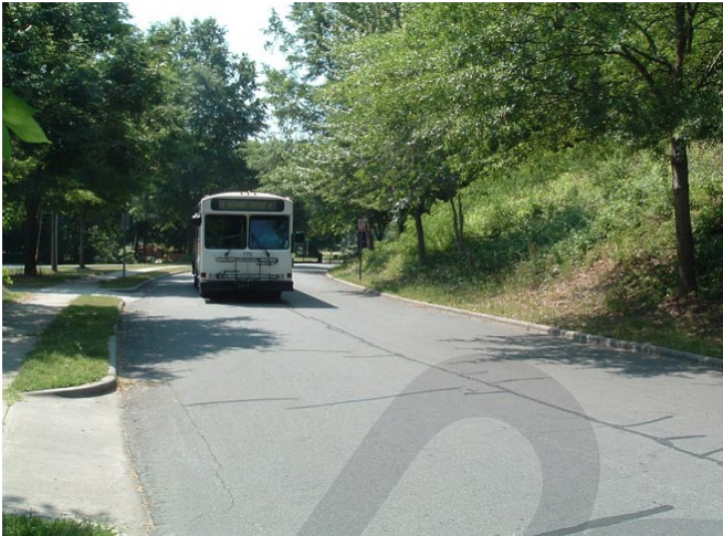
Figure 2.1: Existing conditions on Mitchell Lane looking south. Proposed sidewalk improvements on the west side of Mitchell Lane.

Existing Conditions: Mitchell Lane is a major pedestrian route to the Hargraves Center, contains transit stops along its length, is adjacent to public housing on Craig Street, and also requires special attention as a pedestrian route for children using the Hargraves Center. There is a school bus stop at the intersection of Mitchell Lane and Lindsay Street. Mitchell Lane has sidewalk coverage for the length of the road, but not continuously on one side of the street. Additionally, Mitchell Lane is the only section of the Hargraves Center without an abutting sidewalk.