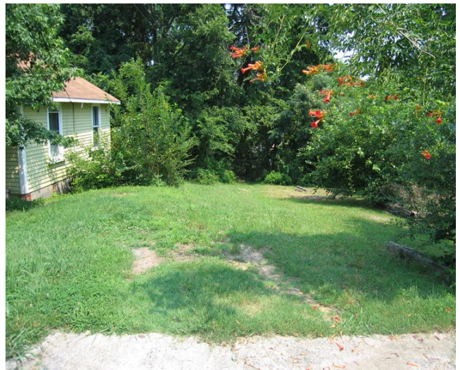
Figure 1.2: Current Right-of-way from the end of Cotton Street to Town property beyond. Proposed pedestrian path location.