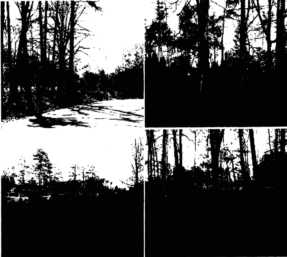
Photo #1 - from Christopher Road toward stoplight & exit Onto Raleigh Road