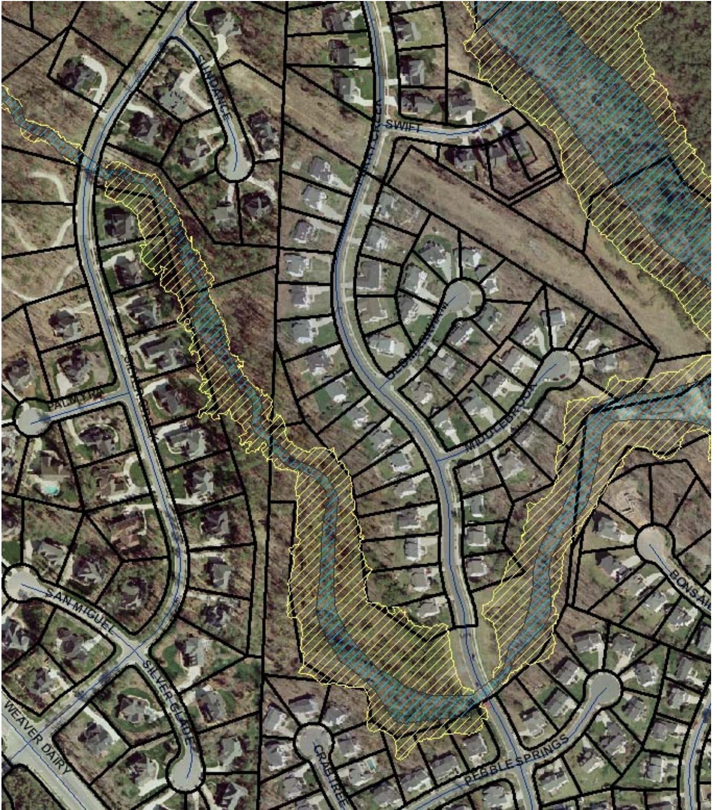
Yellow area - revised Floodplain Blue area - revised Floodway