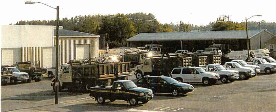
EXISTING PUBLIC WORKS FACILITY October 2003