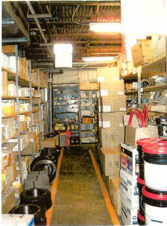
Fleet Maintenance Parts storage area