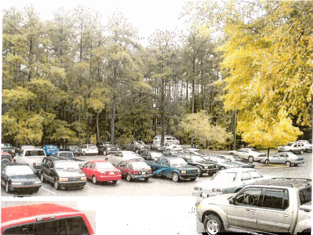
Employee Parking Doubled-up parking in drive aisles