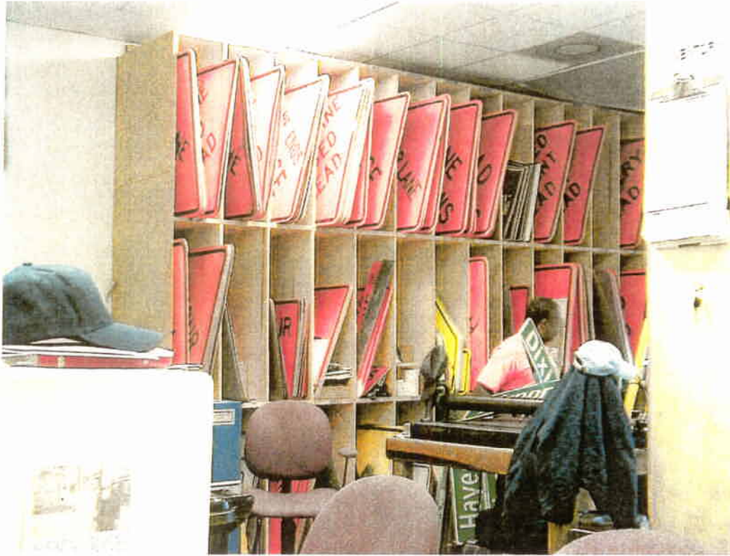
Field Operations Sign production/storage area very cramped