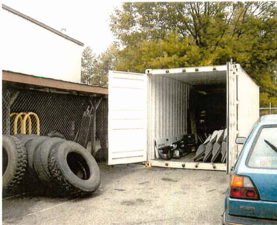
Fleet Maintenance Temporary parts storage areas