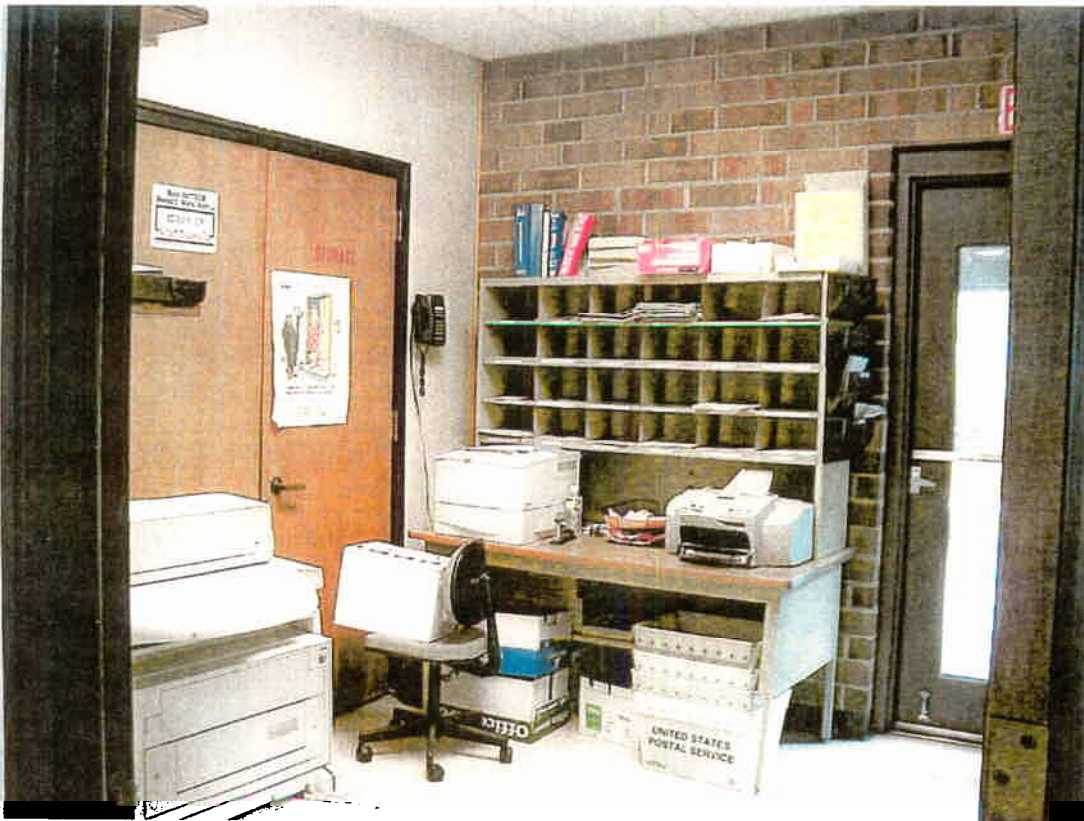
Administration 100 square feet used for mail/copy/printing/fax and hallway