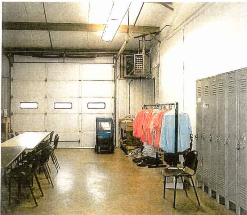
Landscape Bay, Field Operations Building Unconditioned bay space used for lockers, uniform storage, and meeting functions. Furniture must be folded and stored to provide space for equipment maintenance and other uses of the bay.