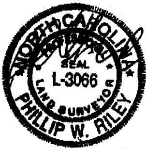
EXHIBIT NEW 30' OWASA SANITARY SEWER EASEMENT AND BOOKER CREEK GREENWAY TRAIL EASEMENT PROPERTY OF LITTLE & CLONIGER PART. CHAPEL HILL TOWNSHIP ORANGE COUNTY, N.C.

N/F FEDERAL REALTY INVESTMENT TRUST DB 621 PG 127 TM 7-45-C-3