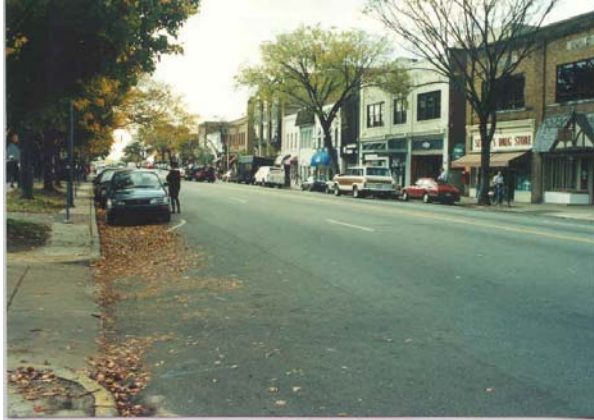
Figure 2 Downtown Chapel Hill

The Existing Land Use Map, Figure 1, shows current land uses in the Town's Urban Service Area and Transition Area. There are approximately 12,900 acres within the Town limits. The Urban Services Area includes about 16,000 acres.