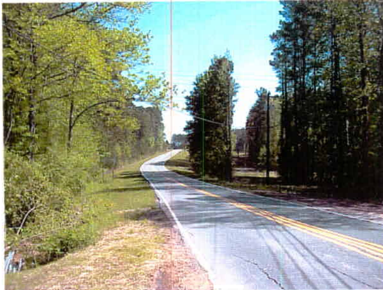
Photo 2 Facing north on Erwin