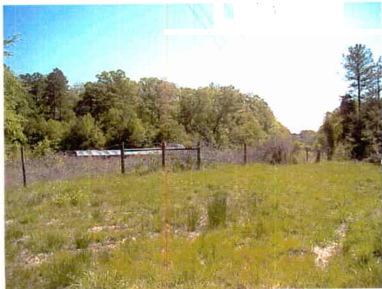
Photo 9 Facing east across I-40 from rear of northern- most parcel (26..36A)