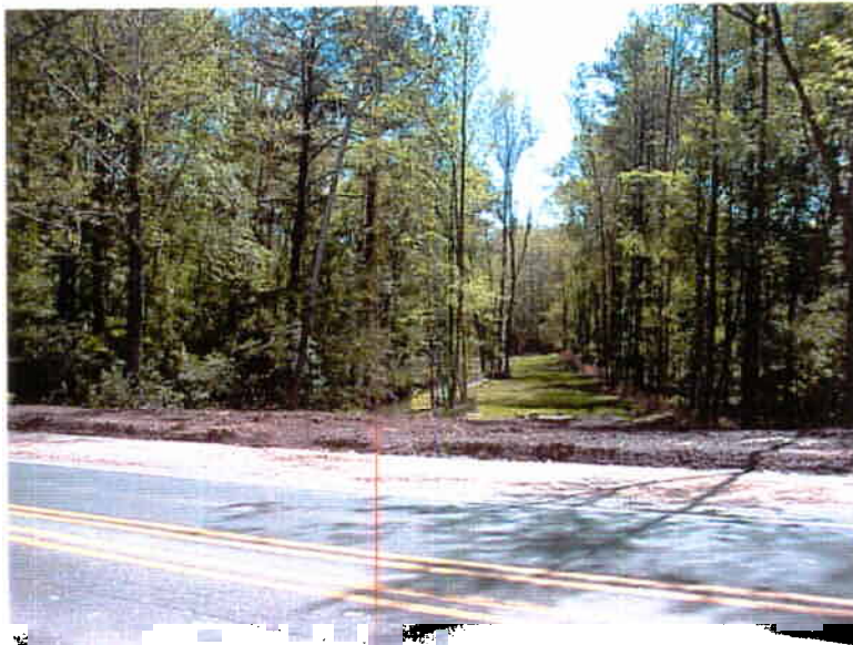
Photo 3 Facing sewer/greenway just south of site across Erwin