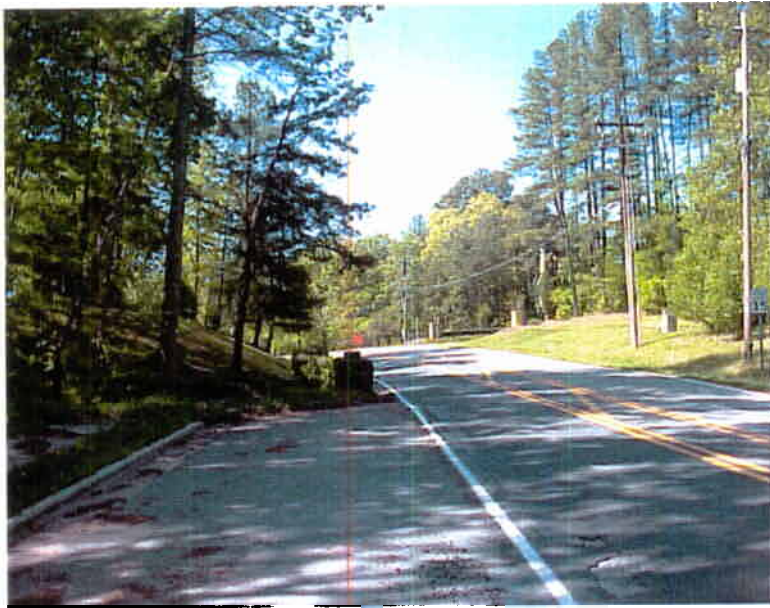
Photo 1 Facing south on Erwin