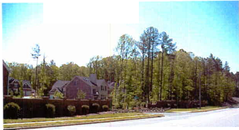
Photo 11 Entrance to Englewood Subdivision, south of site