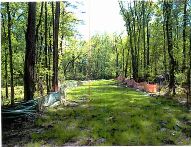
Photo 4 Facing east along greenway south of site