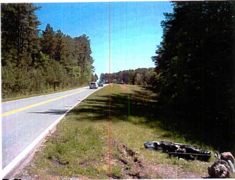
Photo 10 Facing north toward 1-40 on Erwin, from mouth of access road on northern-most parcel (26..36A)