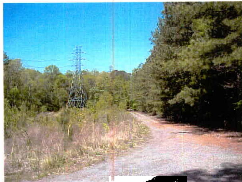
Photo 6 Facing west on access road, north side of Duke Power easement