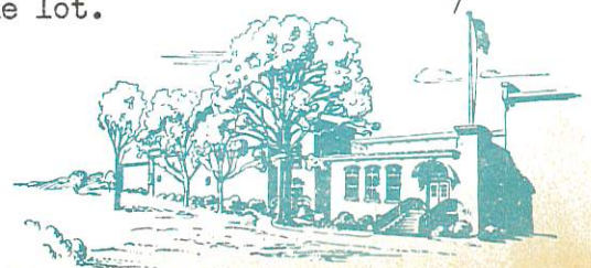
Carrboro Woolen Mills, Division of Pacific Mills Carrboro, North Carolina