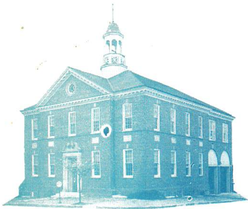
Town Hall, Chapel Hill, North Carolina