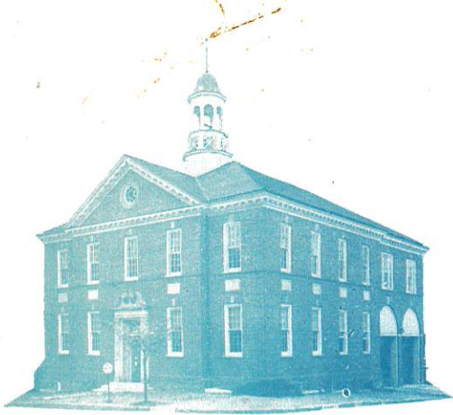
Town Hall, Chapel Hill, North Carolina