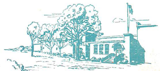
Carrboro Woolen Mills, Division of Pacific Mills Carrboro, North Carolina