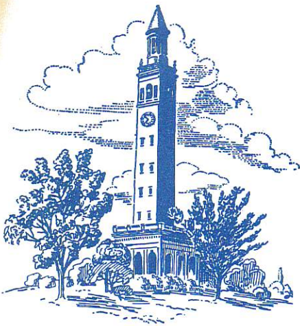
Morehead-Patterson Bell Tower University of North Carolina