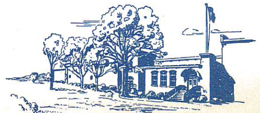
Carrboro Woolen Mills, Division of Pacific Mills Carrboro, North Carolina

We would like to call upon you to appoint such committee as necessary to make an investigation of these conditions mentioned above, and whatever other suggestions you, and the members of the Board, might have to make our town an attractive place to shop.